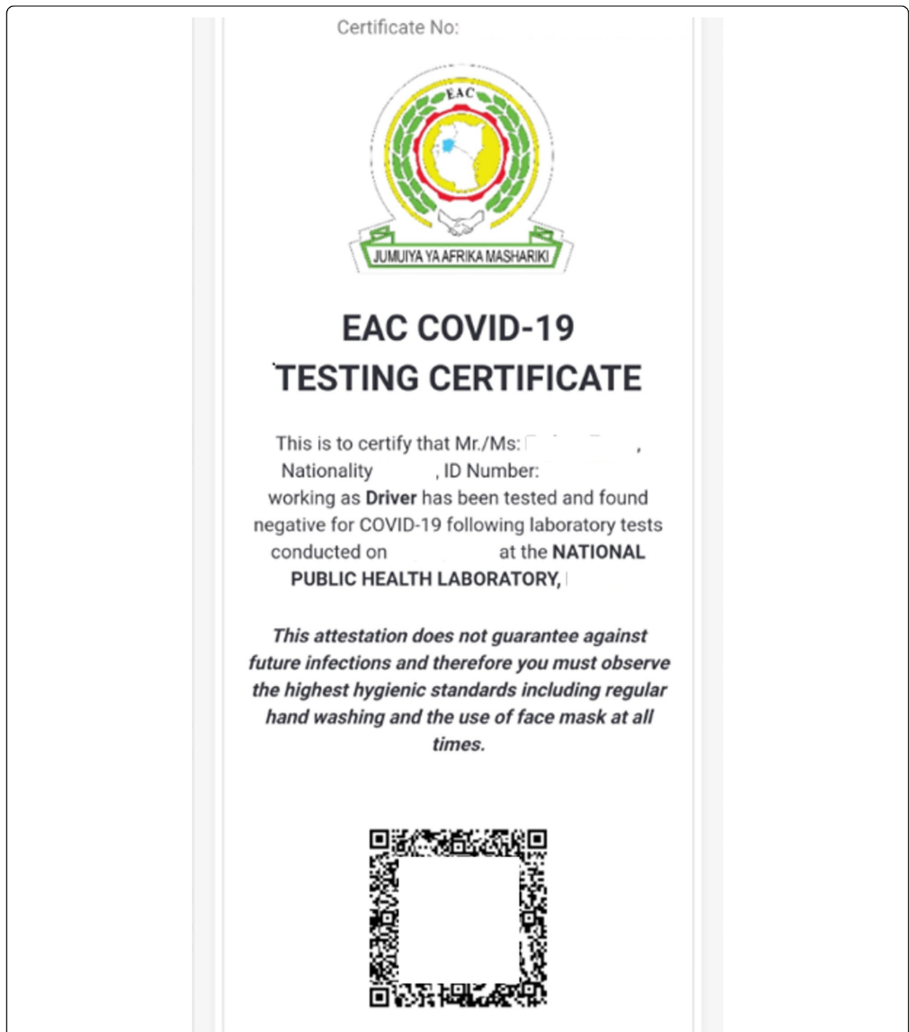
Fig. 2 The electronic “East African Community COVID-19 testing certificate”. The certificate allows SARS-CoV-2 PCR negative truck drivers to move freely for 2 weeks within the region and transport freight between countries. It is numbered and captures name, nationality, ID/passport number, and the country and designation of the testing laboratory. All information is also captured in a machine readable QR-code for quick processing by health authorities, checkpoints and law enforcement officers