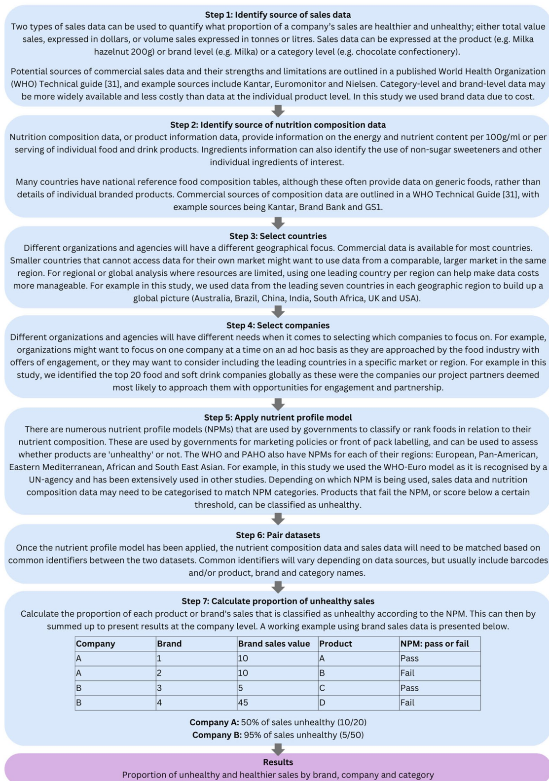
Fig. 1 Detailed guide to developing a tool to assess proportion of companies' sales from healthier and unhealthy foods