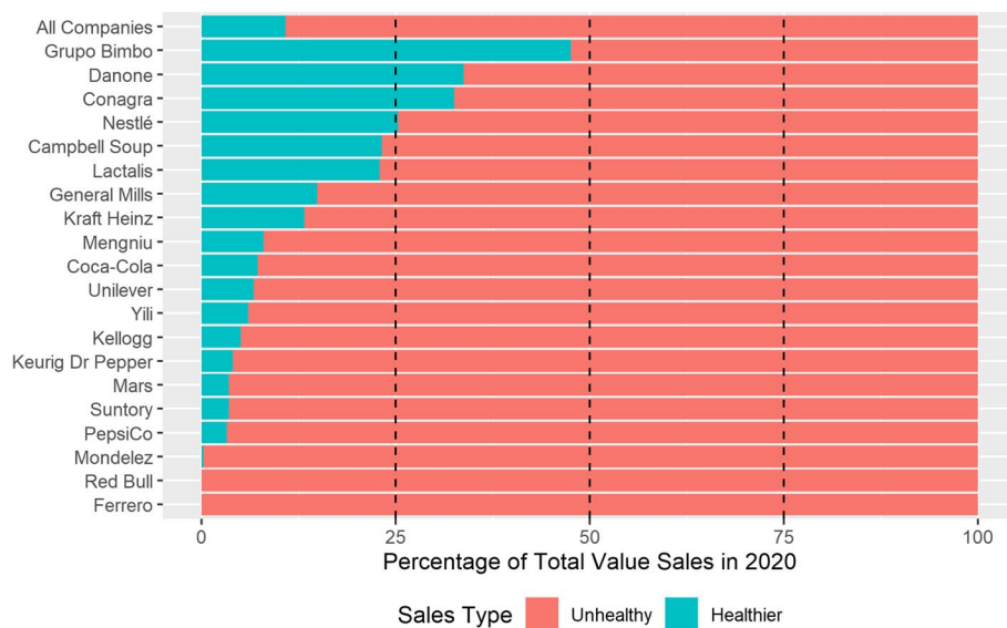
Fig. 3 Proportion of brand sales that are classified as healthier and unhealthy by company